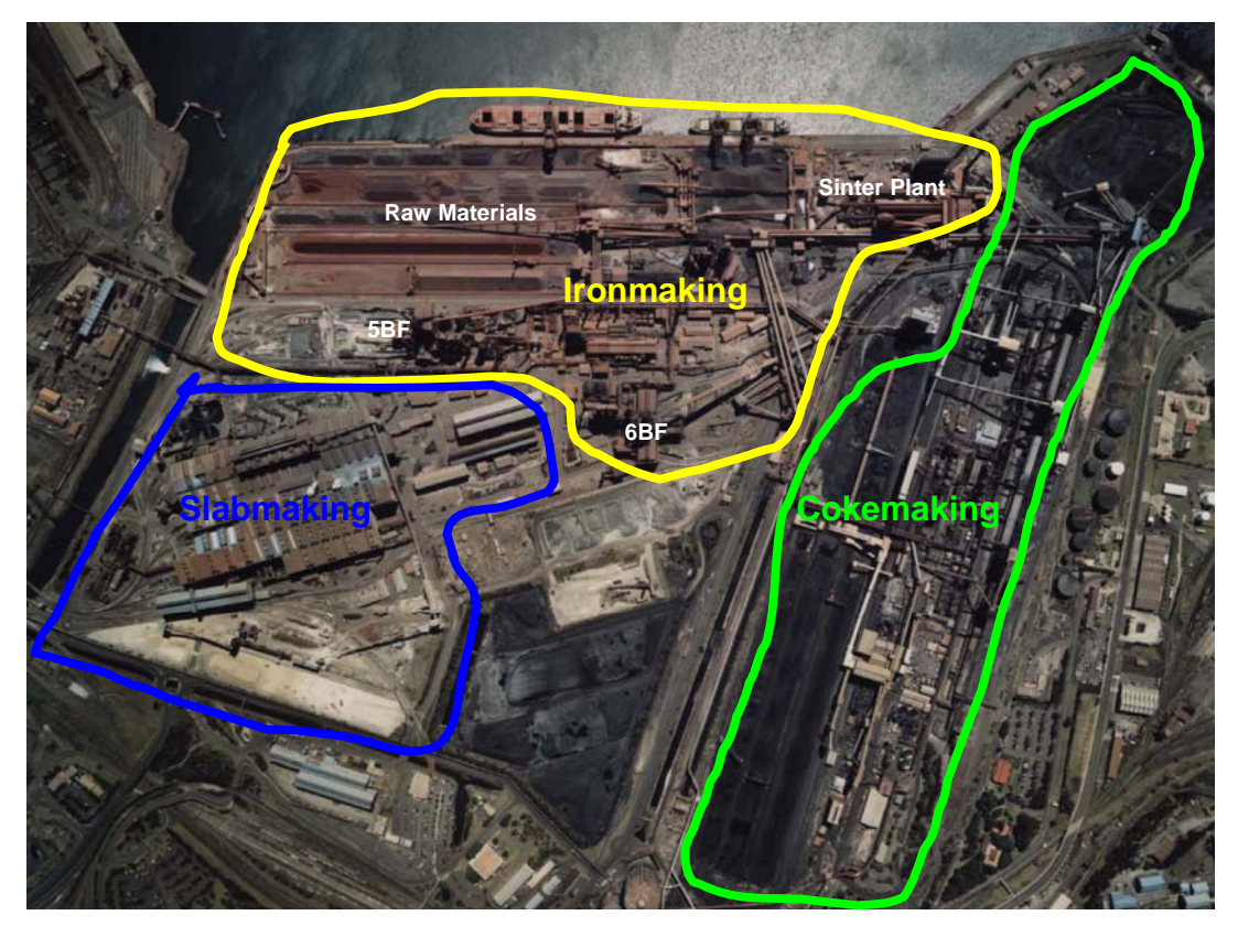
Figure 1. Port Kembla Steelworks